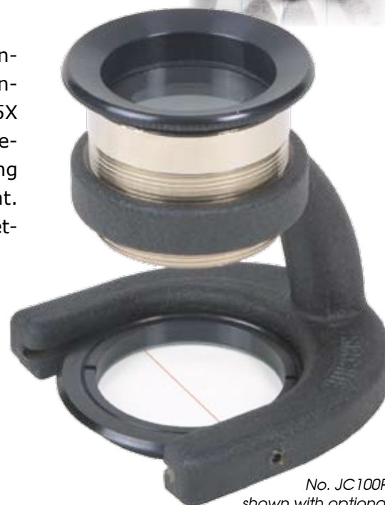
No. JC100P shown with optional No. JC101H Henry Classification Disc (sold separately).

The JC100P , with its specifically designed classification discs featured on the back page, offers the user a superior examination tool with no compromise in quality and performance.