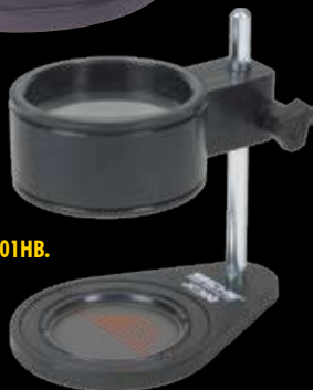
No. JC300 with optional No. JC301HB.