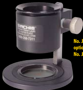
No. JC200 with optional No. JC201M.