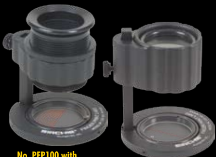
No. PFP100 with optional No. PFHB12.