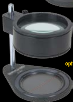
No. JC400 with optional No. JC401H.