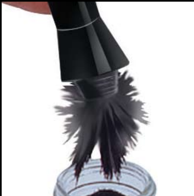
No. 125MD MEGAWAND™ Applicator