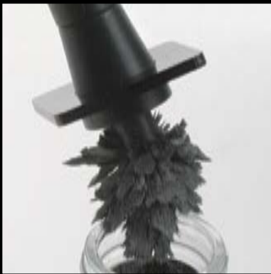
No. 125MBA Magnetic Burnishing Applicator... its use with lifting material is shown below.