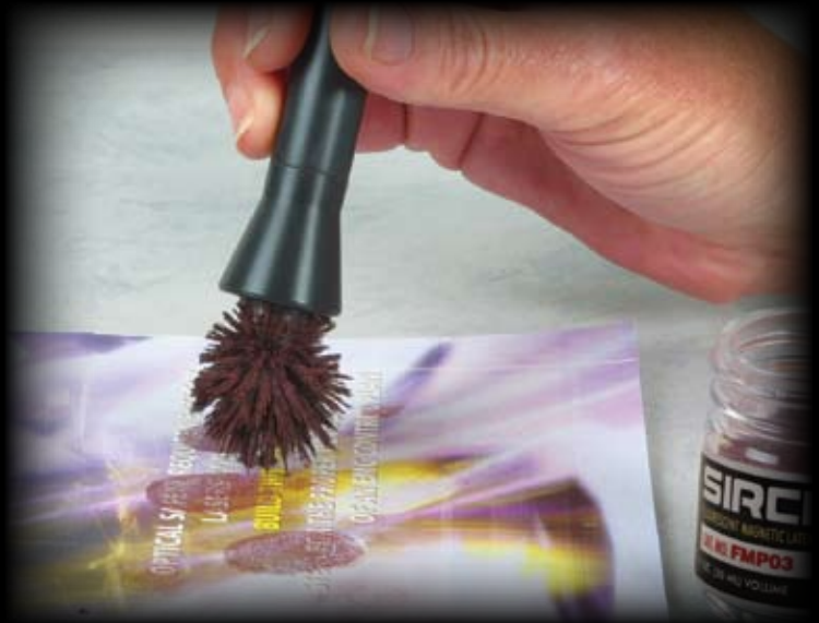
No. FMP03 Dazzle Red is used to develop latent prints on the multicolored surface of a magazine cover.