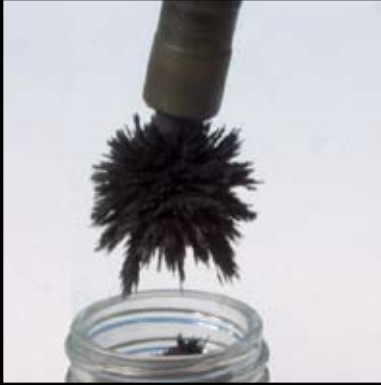
No. 125L Standard Magnetic Powder Applicator