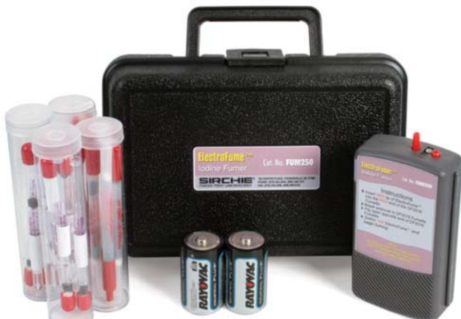
No. FUM250 Kit and Components