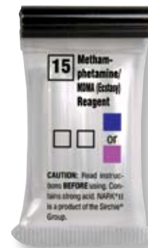
NARK20015 Methamphetamine Reagent MDMA