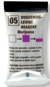
NARK2005 Duquenois-Levine Reagent Marijuana