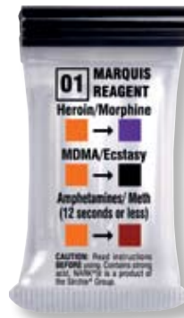
NARK2001 Marquis Reagent General Screening