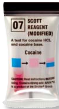
NARK2007 Scott Reagent Modified Cocaine HCl/Crack