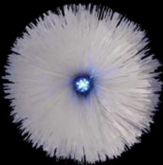
No. MBLB100 brush head view of LED.