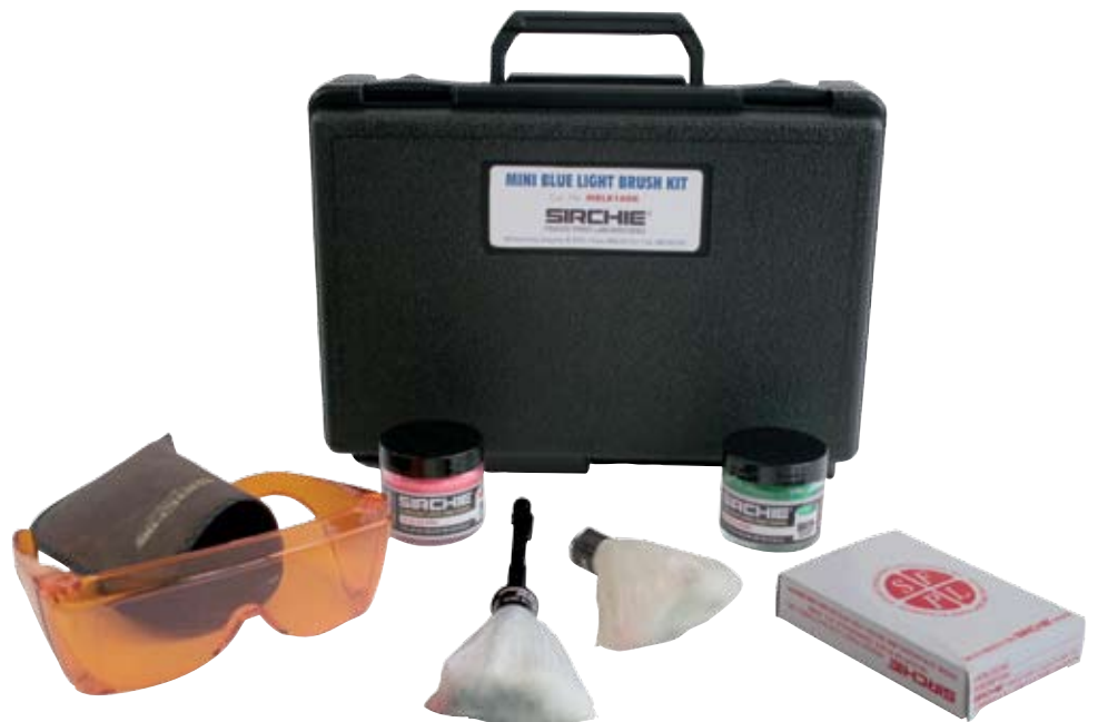
No. MBLB100K Kit and Components