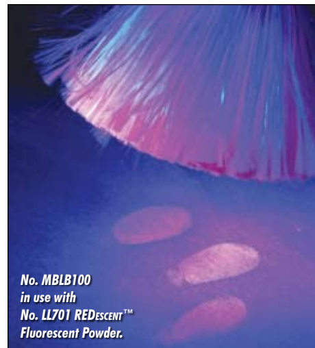
No. MBLB100 in use with No. LL701 REDESCENT™ Fluorescent Powder.

Latent prints aren't always found in convenient locations. These brushes are particularly useful for dusting in darkened corners, under furniture, inside motor vehicles, etc. Utilizes 3 AAAA alkaline batteries, incorporates a 30,000-hr. LED and has an exceptionally long-life fiberglass brush head.