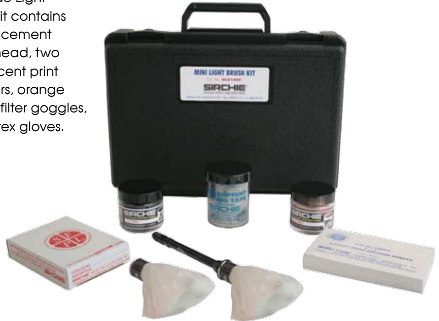
No. MLB100K Kit and Components

For added convenience, we paired the MLB100 Mini Light Brush and the MBLB100 Mini Blue Light Brush up in their own kits. The MLB100K Mini Light Brush Kit contains a replacement brush head, two latent print powders, transparent lifting tape, backing sheets, and latex gloves. The MBLB100K Mini Blue Light Brush Kit contains a replacement brush head, two fluorescent print powders, orange barrier filter goggles, and latex gloves.