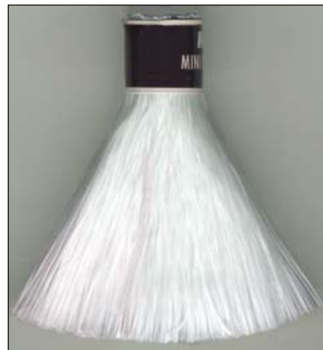
No. MLB101 replaceable fiberglass brush head.